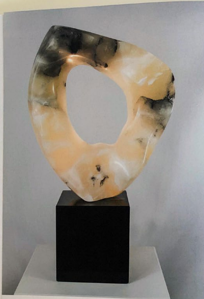
A (Whole), 2017 alabaster, granite pedestal