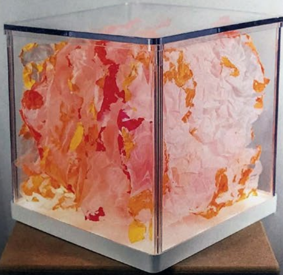
Lightbox "Bloom 3D N°1" flat volumes, 2017 24x24x24 cm, tracing paper with acrylic paint LED illuminated box