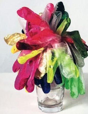
Making of ..., 2017 latex gloves, used for the creation of flat volumes

>> Aus der Reihe tanzen flat volumes, 2017 1,02x0,52 m, tracing paper with acrylic paint wooden frame