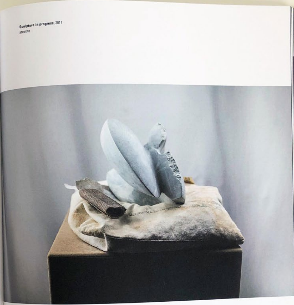
Sculpture in progress, 2017 steatite